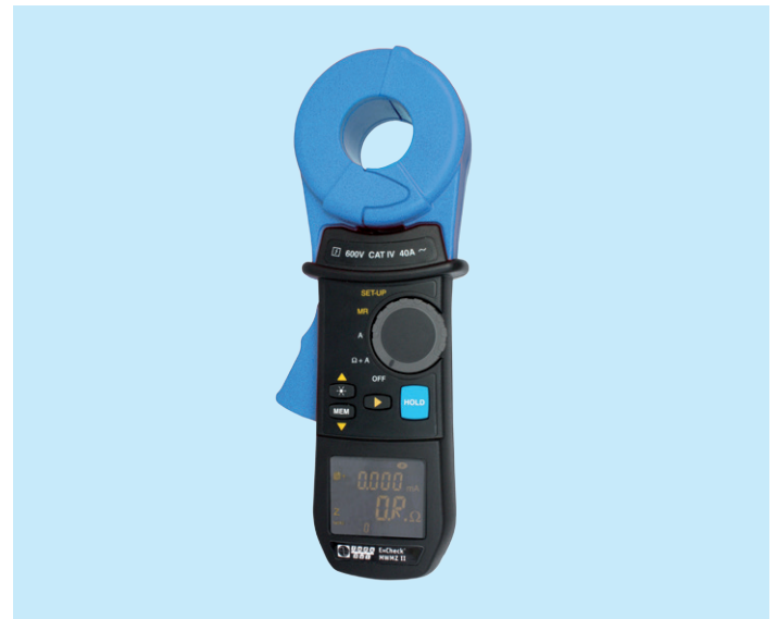
EmCheck® MWMZ II